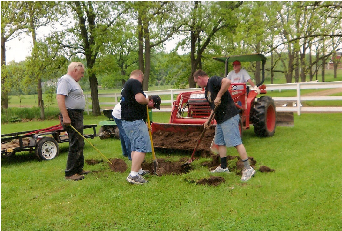
BELLEVUE CAMPGROUND TREE PLANTING MEMORIAL DAY WEEKEND